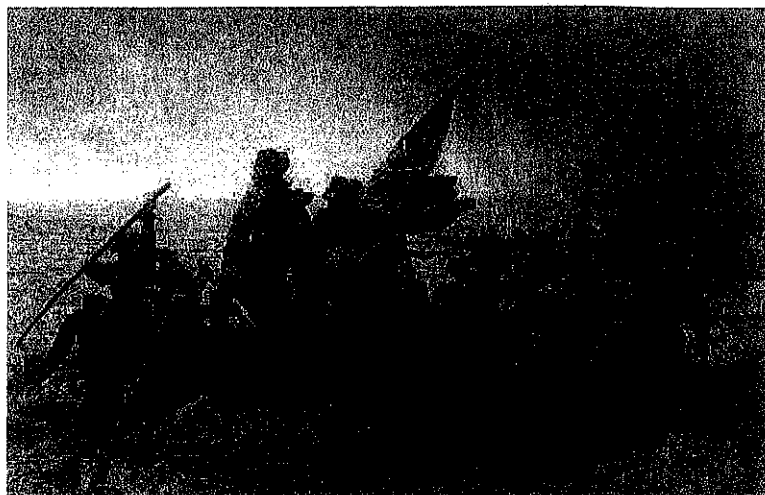
In 1851, Emanuel Leutze painted this picture of Washington and his troops crossing the Delaware River.

It was a major victory for the American Continental Army and it raised their morale.