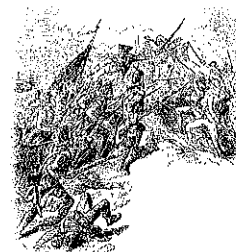
Battle of Bunker Hill

1775 _____ Of _____ Hill British took the hill outside Boston but lost many more soldiers than the American defenders.