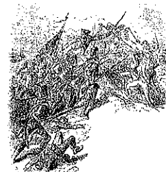
Battle of Bunker Hill

(Site of First and Second Continental Congresses)